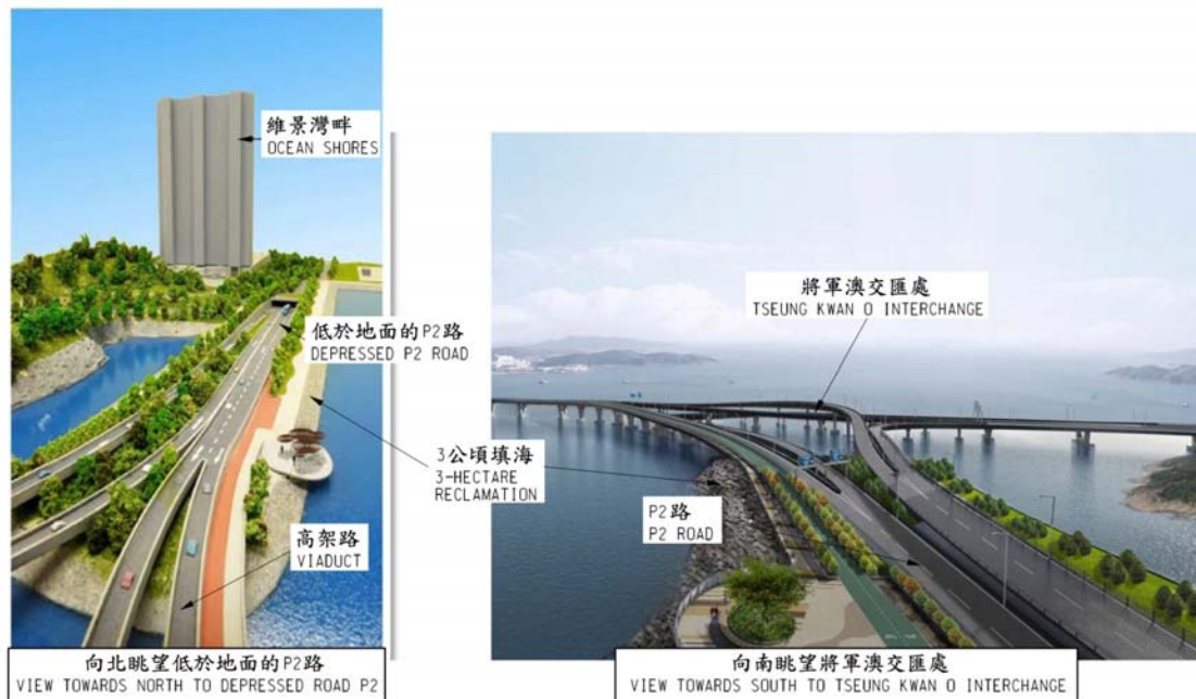
Depressed Road P2 and Tseung Kwan O Interchange