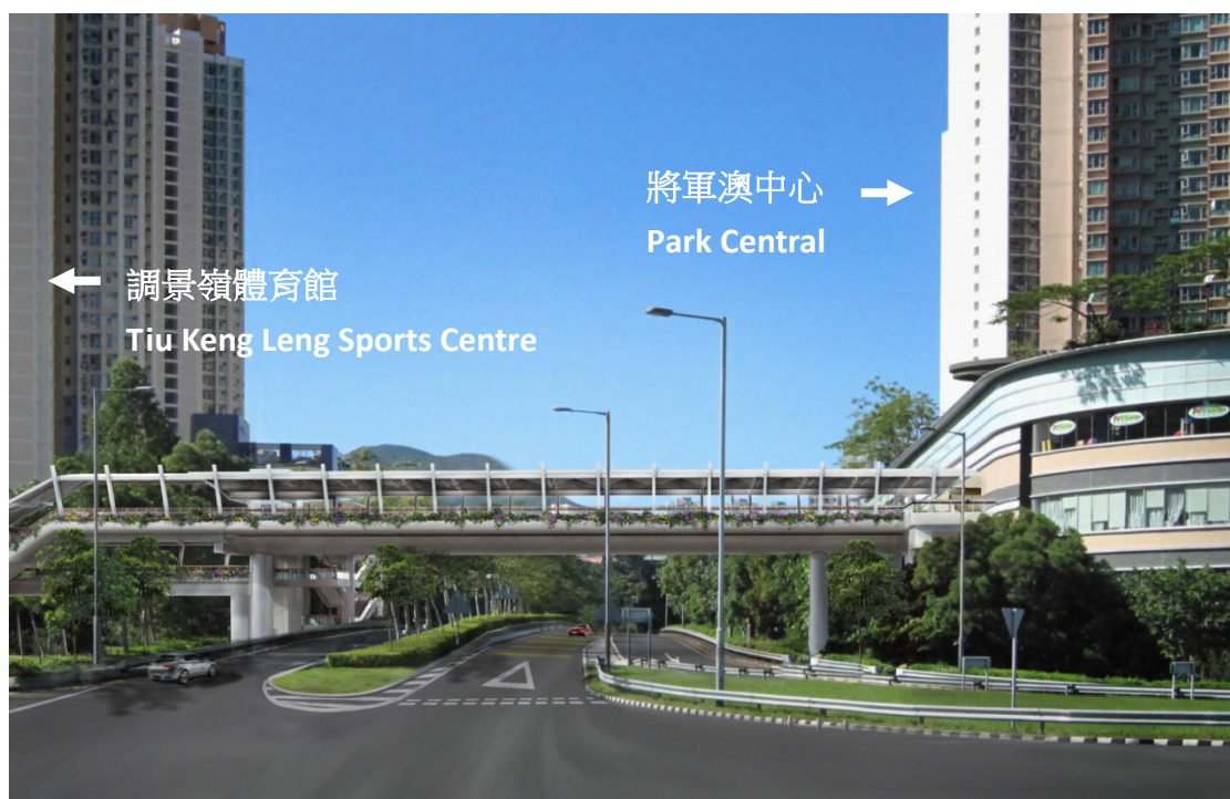
Footbridge connecting Park Central and Tiu Keng Leng Sports Centre

The residents and district councillors of both Kwun Tong and Sai Kung Districts have been urging for provision of a bus-bus interchange (BBI) in the TKO-LTT project. After considerable effort, the Government finally managed to incorporate a BBI in Lam Tin Interchange, even though it is congested with