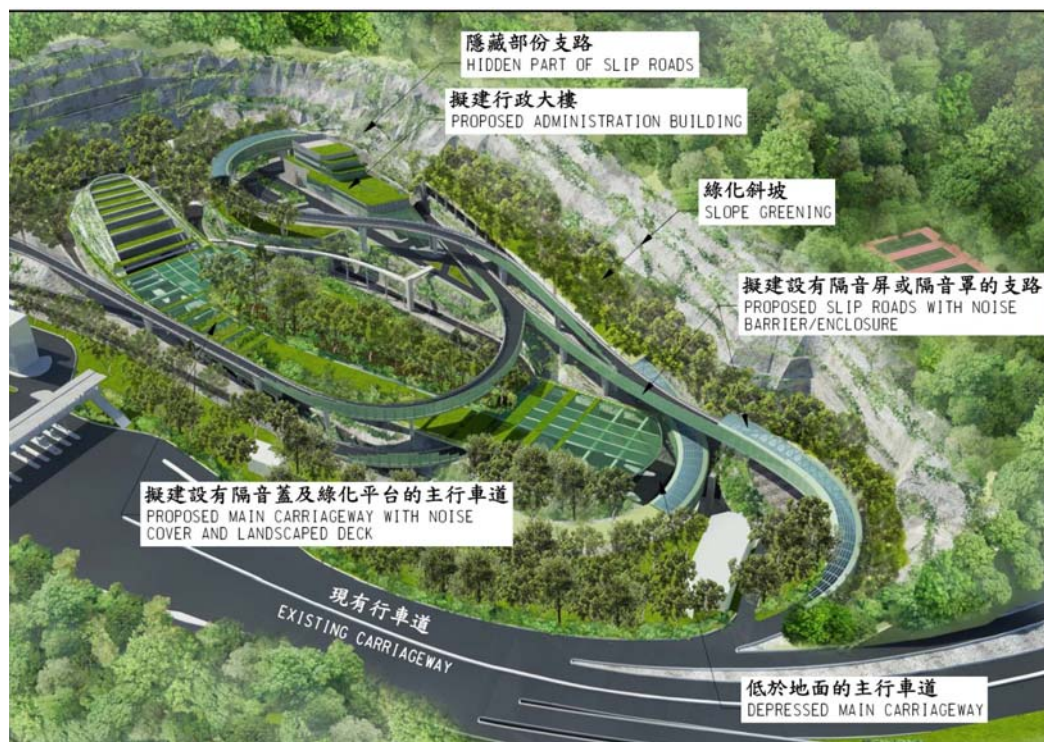
Lam Tin Interchange

Implementing a major road project in urban area will unavoidably cause impacts to nearby residents. The Government has strived to minimize the impacts so as to address public concerns and to comply with the requirements of the Environmental Impact Assessment Ordinance. The main carriageway of the Lam Tin Interchange will be constructed at around 20 metres (m) below the adjacent ground level and will be covered with a landscape deck and noise cover. Moreover, some slip roads of the Lam Tin Interchange will be constructed in tunnel form, hidden between cut-slopes or provided with noise barriers or noise enclosures. As regards the proposed Road P2 adjacent to Ocean Shores in TKO, it will be constructed in the form of a depressed road and will be partly covered by a landscape deck to minimize the visual and noise impacts to the nearby residential estates. The landscape deck will connect the amenity areas on both sides of Road P2 rendering more green space. It will also provide a convenient access to the promenade in TKO South.